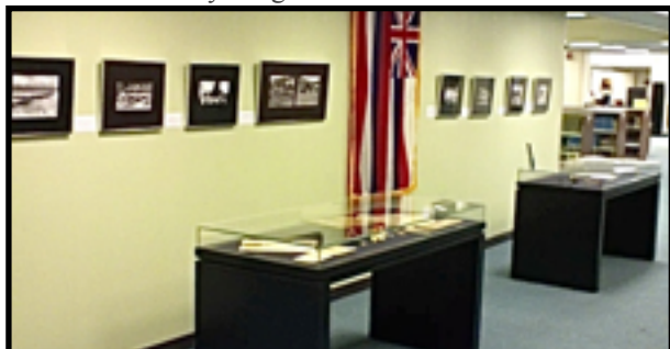
Exhibit at Hamilton Library