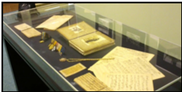
Henry Berger's Memorabilia

Royal Hawaiian Band Exhibit at Hamilton Library Read article on page 2