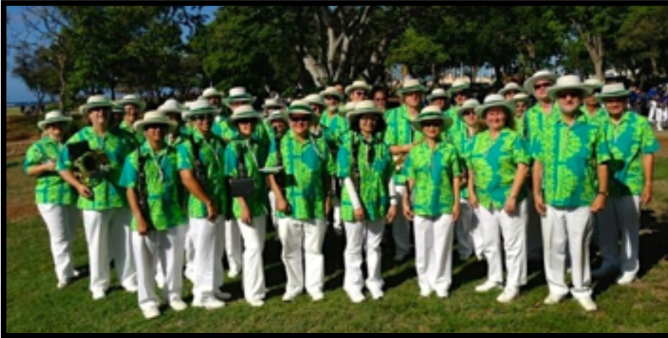
Band members sport their new uniforms before they debuted them at the Aloha Festivals Floral Parade on September 22, 2013. The uniform's fabric and style was professionally designed by Mamo Howell .