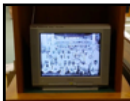
Video part of exhibit